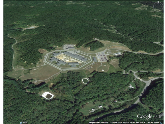
Google Earth 3D Image

Property Size Acres 189.16 acres GPS Coordinates 37.296916, -81.365502 Number of sites in Parcel 1 Annual Energy Usage (Parcel) 6,147,750 kWh Utility Provider ApCo