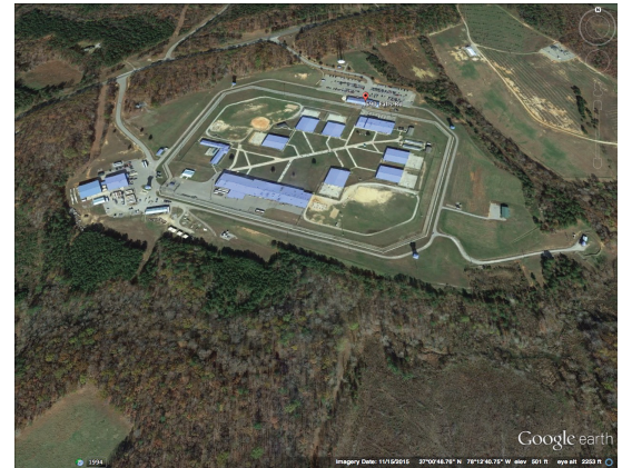
Google Earth 3D Image

Property Size Acres 89.49 acres GPS Coordinates 37.015230, -78.211662 Number of sites in Parcel 1 Annual Energy Usage (Parcel) Unknown at this time Utility Provider Other/Unknown