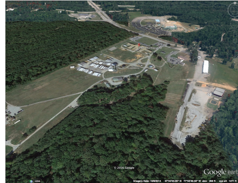
Google Earth 3D Image

Property Size Acres 80.57 acres GPS Coordinates 37.403100, -77.563341 Number of sites in Parcel 2 Annual Energy Usage (Parcel) 2,094,993 kWh Utility Provider Dominion