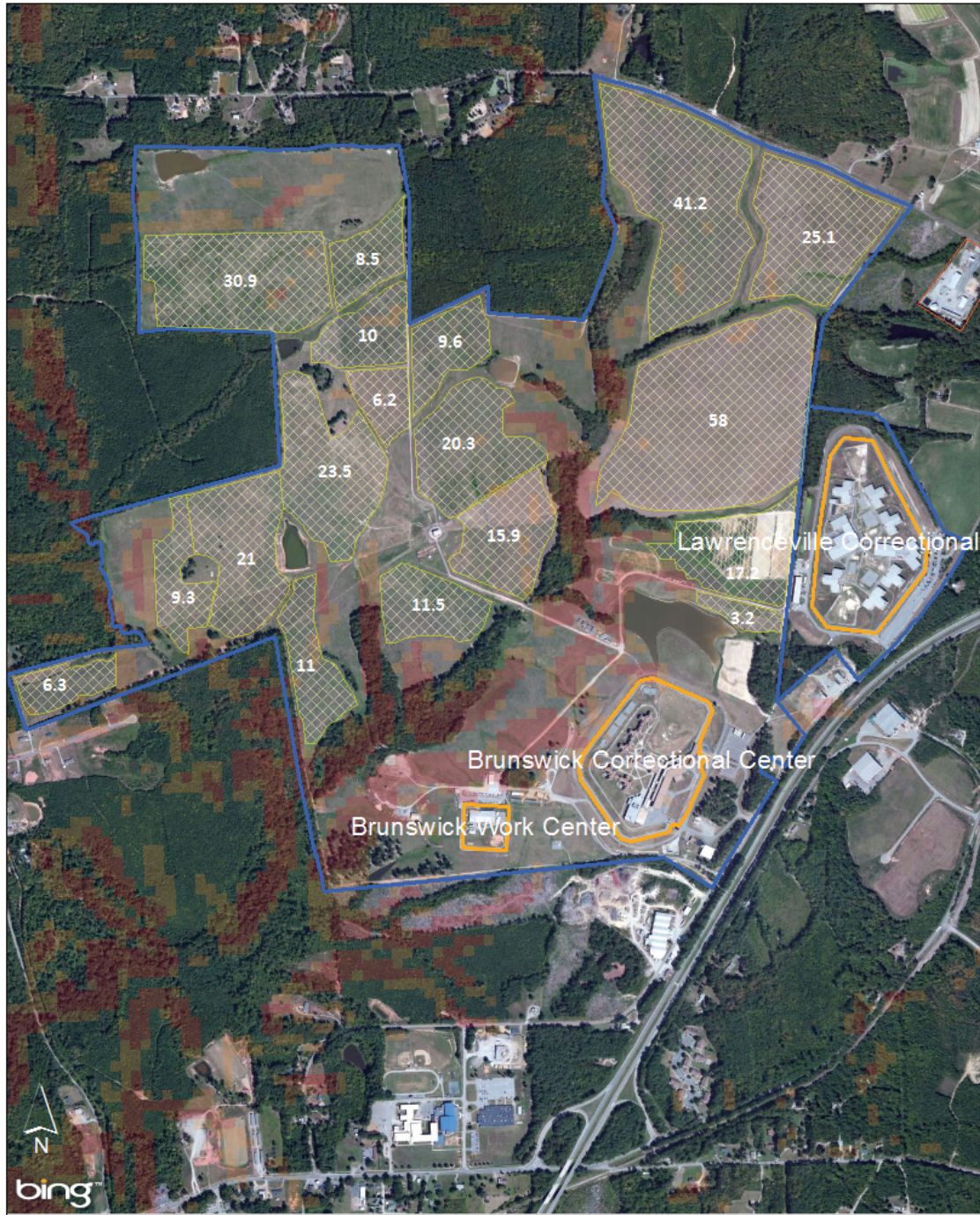
Esri ArcGIS Screenshot