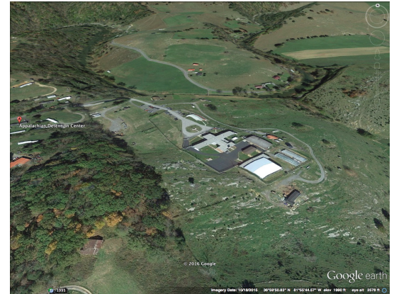
Google Earth 3D Image

Property Size Acres 80.4 acres GPS Coordinates 36.998004, -81.929173 Number of sites in Parcel 1 Annual Energy Usage (Parcel) 732,348kWh Utility Provider ApCo