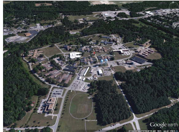
Google Earth 3D Image

Property or Site Name: Central State Hospital Address: 26317 West Washington St City State Zip: Petersburg, VA 23803 County: Dinwiddie County